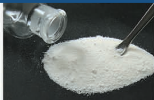
Sugars and Sweeteners