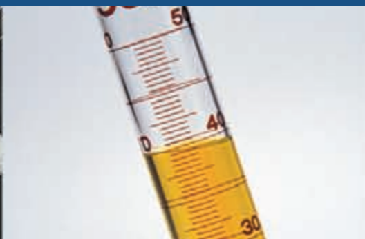
Essential oils, Flavors and Fragrances